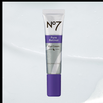
Pure Retinol Eye Cream