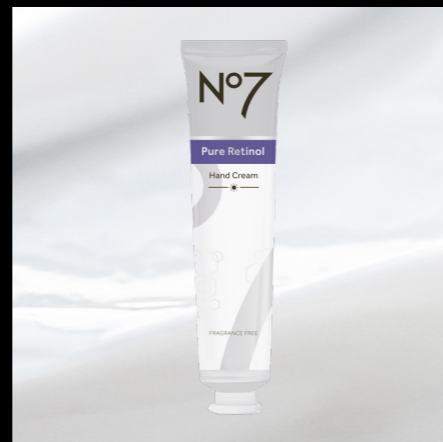
Pure Retinol Hand Cream

No7's NEW Pure Retinol range is powered by an age-defying partnership of Pure Retinol, the most effective, targeted and proven form of retinol, and Matrixyl 3000+™ a powerful peptide blend, helping improve the appearance of lines and wrinkles over time.