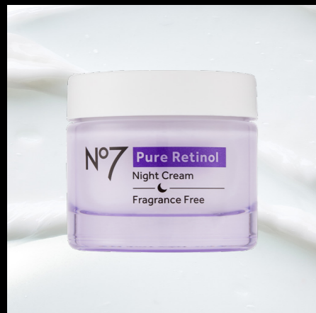
Pure Retinol Night Cream

The range includes three NEW products, specifically formulated to minimise irritation, whilst being able to use together.